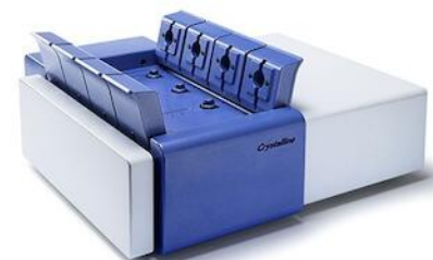
Crystalline SEE IT ALL